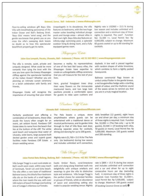
5 Villas to say "I do"

Your wedding is a special day for you and your loved one, and the choice of venue plays an important role in making your party unforgettable. Without the right venue, all those efforts to capture the intimacy and importance of the event will fall flat. If you wish for an intimate wedding, these villas are just perfect